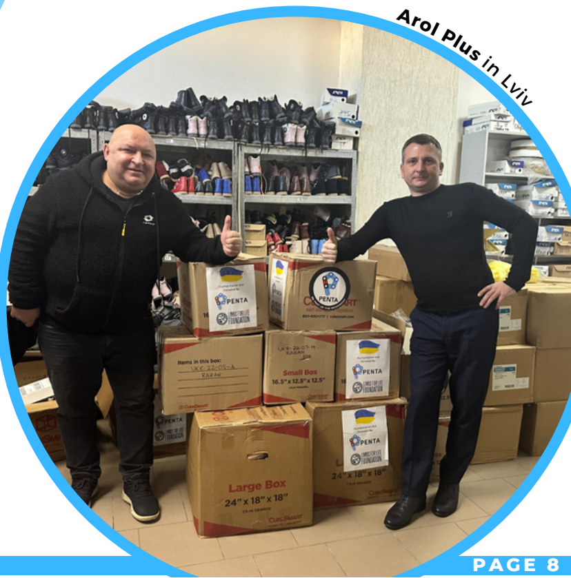
Arol Plus in Lviv

When the war broke out, individuals and organizations spanning the US prosthetics industry have been meeting regularly to discuss and respond to the ever-changing need for mobility assistive technology in an area of active conflict. The groups involved in this collaborative effort include Penta, Limbs for Life Foundation, American Orthotic and Prosthetic Association (AOPA), Amplitude Magazine, and individuals from Wake Forest University. Together we have been able to combine resources and share information to increase our impact and ensure the needs of Ukrainian amputees are being met.