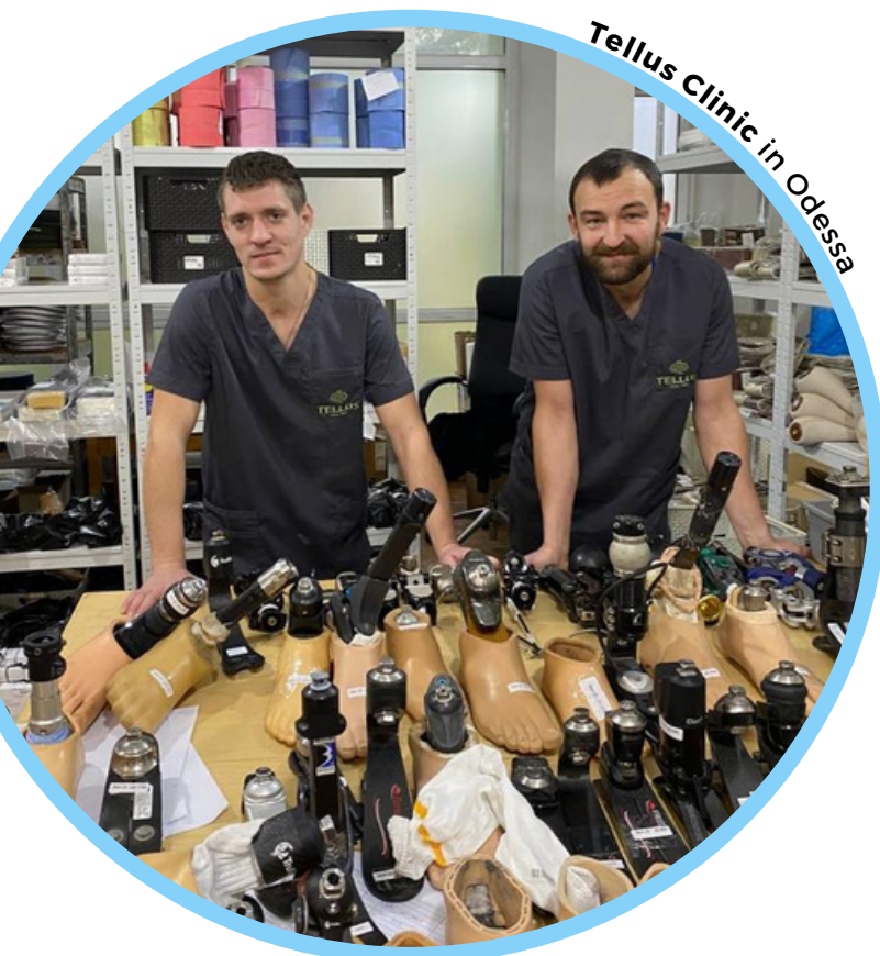
Tellus Clinic in Odessa

While the focus of our work in Ukraine is to provide prosthetic devices, we have been able to facilitate additional aid as well by mobilizing our vast network of partners to respond to other urgent needs. In the spring of 2022, Penta connected several Ukrainian aid groups with Partners for World Health (PWH), resulting in PWH sending a container of life-saving medical supplies and equipment totaling over 20,000 pounds . We continue to leverage our vast and strong network of partners to provide help however and wherever we can.